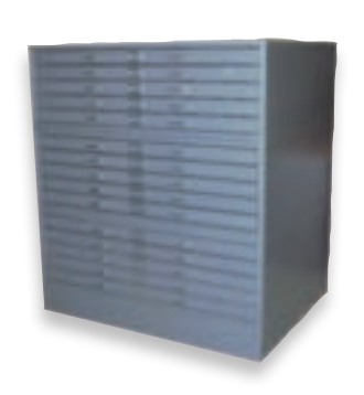
STANDARD & SPECIALTY DRAWERS