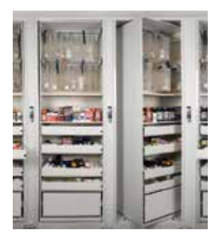
ROTARY STORAGE CABINETS