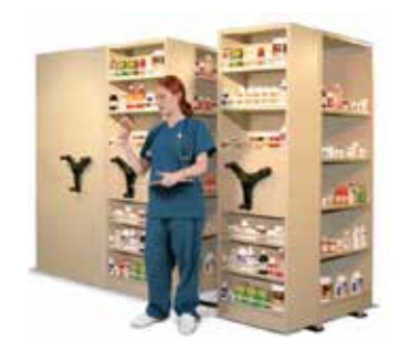
HIGH DENSITY MOVABLE SHELVING