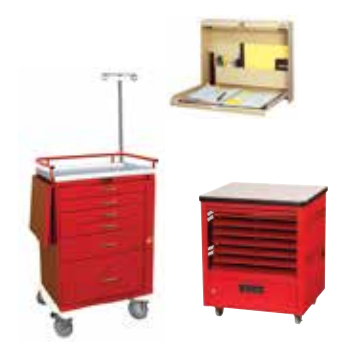
SECURITY CARTS AND WALLRIGHTS